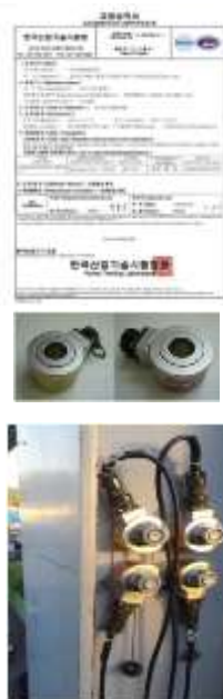
[Tension measuring sensor]