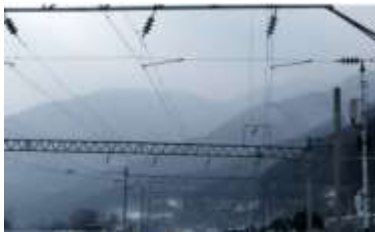
[Catenary and messenger wire]