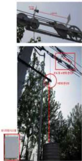
[Displacement measuring sensor]